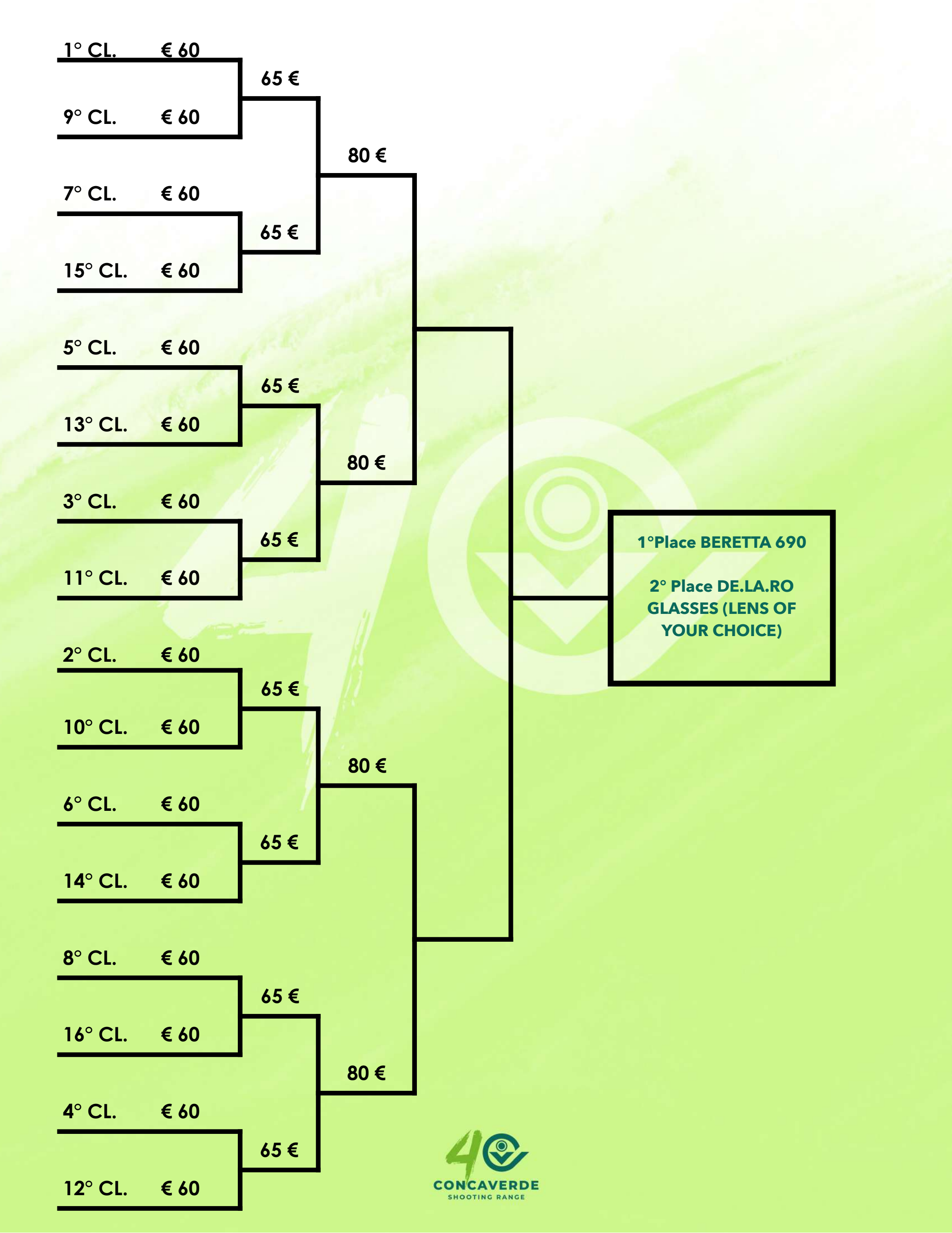
CAT. EXC. - 1<sup>st</sup> (united) CAT. 2<sup>nd</sup> CAT. 3<sup>rd</sup> VETERANS - MASTER (united)